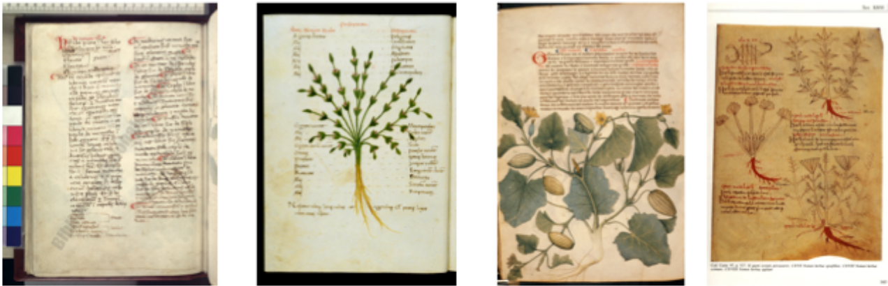
Fig. 1 Sample images of the IPSA digital archive

in Cesena 14 . Indeed, the Malatestiana on-line open catalogue 15 presents a number sections [12,13] that, together with the typical ones providing information about the library and access to its search facilities (searches can be done by call number, illuminator, subject, date, and so on), also include the “Contributed bibliography” and the “Building site”. The former enables all registered users to add new bibliography to the manuscript descriptions, thus creating a new record with the related references; the record will become visible to other users after validation by the website administrator. The latter is a virtual space where registered users can contribute to the study of a single manuscript. Up to now two building sites have been created, the first on a IX century manuscript with Isidore of Seville’s Etymologiae (ms. S.XXI.5) and the second on a Gospel Book dated 1104. The website is available in Italian, English and German.