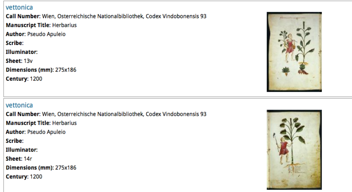
Fig. 3 Faceted search

deeper into a particular topic, or to leave the narrative path entirely in order to undertake independent exploration, secure in the knowledge that a single click will return them to the narrative. The content is notable for its complexity, and the tools that the environment provides add further layers of richness.