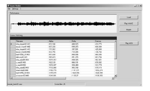
Fig. 2. The prototype system.

After having uploaded the system with an unknown music file, the user is presented with a list of candidate recordings which are sorted in order of relevance and may be played for verifying if they have been correctly identified. The main interface is reported in Figure 2. Current research is oriented towards the integration of the standalone prototype with the distributed P2P architecture, by spreading the database among the peers, which compute a partial match with the unknown recording. Such a solu-