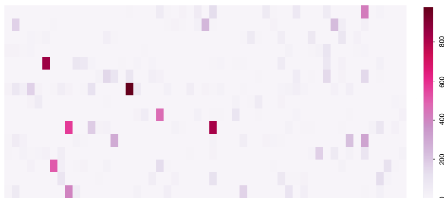
Fig. 1. Heat-map of the distribution of credit to the family table. Each cell represents a tuple in the table.

webpages of GtoPdb report the URL of the referenced page. It is possible from these URLs to reverse-engineer the SQL queries that compute the data contained in the webpages. A webpage is composed by different parts, each part created with data extracted from the GtoPdb through SQL queries. We use these queries to perform DCD. We focused only on queries referring to the so-called target families 1 .