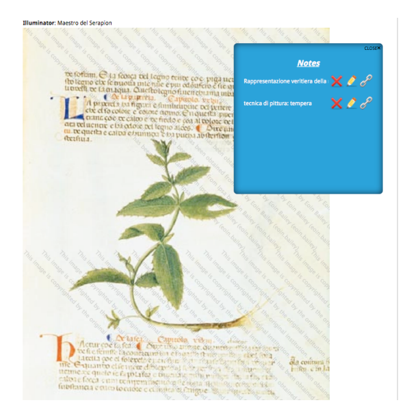
Figure 3. Some notes have been associated to a document.